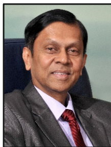
AJITH NIVARD CABRAAL

Hon'ble Former Judge, Supreme Court of India, India