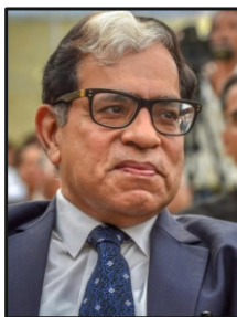
JUSTICE A. K. SIKRI (Chairman)

Hon'ble Former Judge, Supreme Court of India, India