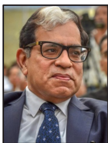
Justice A.K. Sikri

Chairman; Former Judge, Supreme Court of India; International Judge, Singapore International Commercial Court