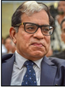
JUSTICE A. K. SIKRI (Chairman)

Chairman; Former Judge, Supreme Court of India; International Judge, Singapore International Commercial Court